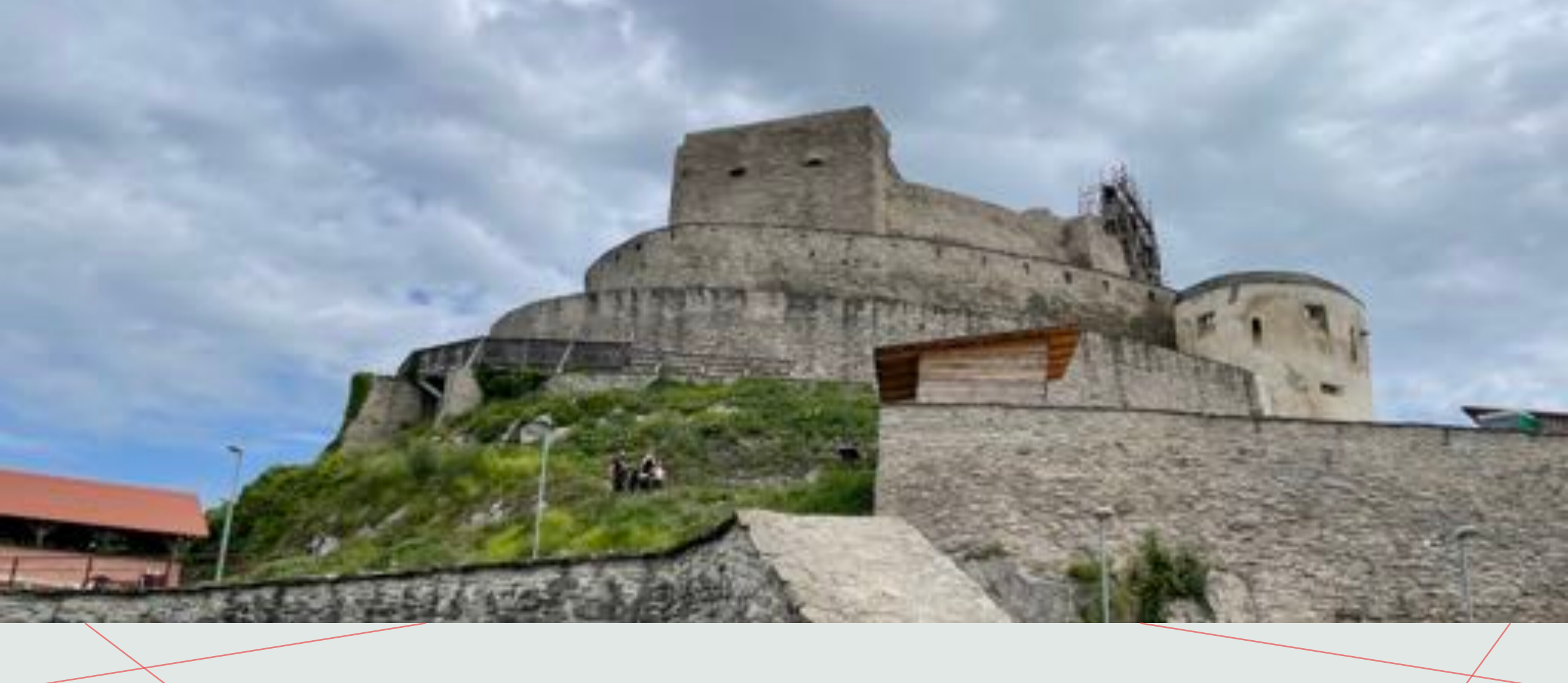
DEVA FORTRESS SITE WHERE FRANCIS DAVID WAS IMPRISONED AND DIED