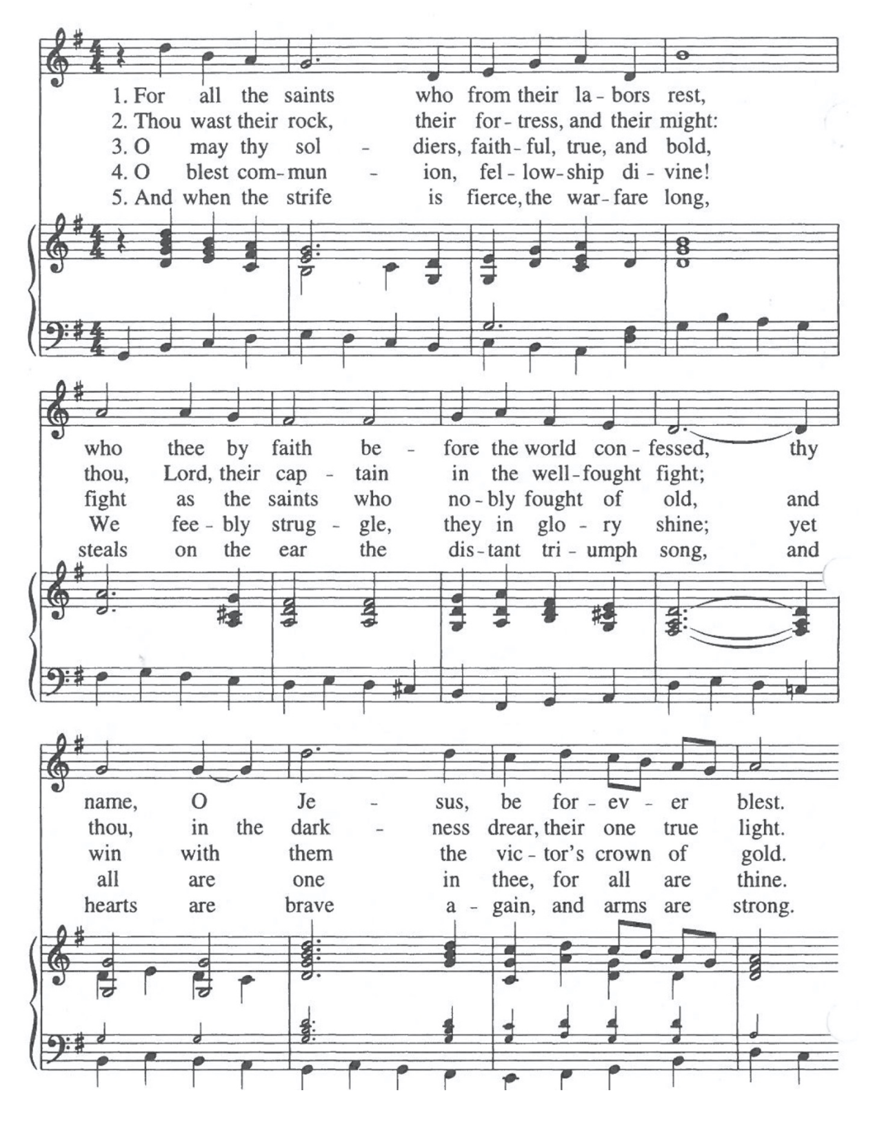
6. May we like they be safe in our own way, Living our lives to better each new day. And at life's end, may we be bold to say: Alleluia! Alleluia!